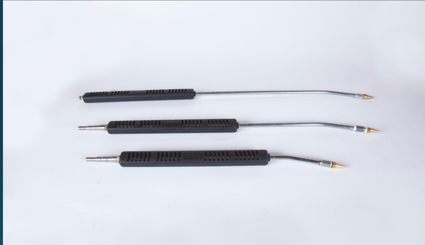
INDUSTRIAL STEAM LANCES (90 cm. / 70 cm. / 50 cm.)